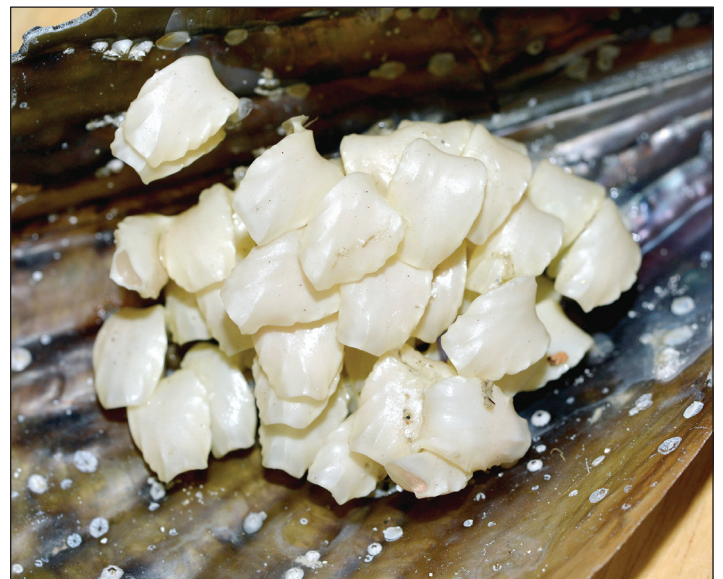
Alphabet Cone, egg capsules from Sanibel