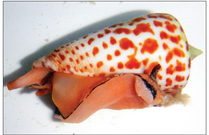
Live Alphabet Cone from Kice Island, Collier County

Reference: Leal, JH, AJ Kohn and RA Mensch. 2017. A veliconcha unveiled: observations on the larva and radula of Conus spurius , with implications for the origin of molluscivory in Conus . American Malacological Bulletin 35(2): 111-118.*