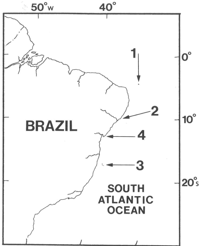
Figure 1. Distribution of Rissoina indiscreta new species; numbers indicate localities: 1. Atol das Rocas; 2. Jaraguá and Ponta Verde, Maceió, Alagoas; 3. Abrolhos Reef Complex, Bahia; 4. Itapoã e Praia do Forte, Bahia. The same numeration for localities 1–3 is present in Table 1.

drift'; Paratypes 8–11, MNHN, type locality, P. S. Cardoso, 'beach drift'; Paratypes 12–15, USNM 859335–38, type locality, P. S. Cardoso, 'beach drift'; Paratypes 16–18, MNRJ 5761, type locality, P. S. Cardoso, 'beach drift'; Paratypes 19–22, BMNH 1988.043, type locality, P. S. Cardoso, 'beach drift'; Paratypes 23–24, MORG 25463, Atol das Rocas (03°52'S, 33°49'W), Brazil, J. H. Leal, G. W. Nunan, C. B. Castro and D. F. Moraes, Jr., 02/1982, 'calcareous sand'; Paratypes 25–28, MORG 25464, Abrolhos Reef Complex (1758'S, 38°42'W), Bahia, MORG Expedition 02/1978; Paratypes 29–30, UMML 8347–48, Jaraguá, Maceió, Alagoas, Brazil (09°38'S, 35°44'W) P. S. Cardoso, 1965.