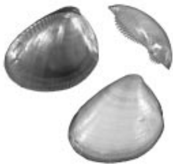
The tiny Atlantic nut clam, Nucula proxima , is one of the species recently added to the Museum Web site.