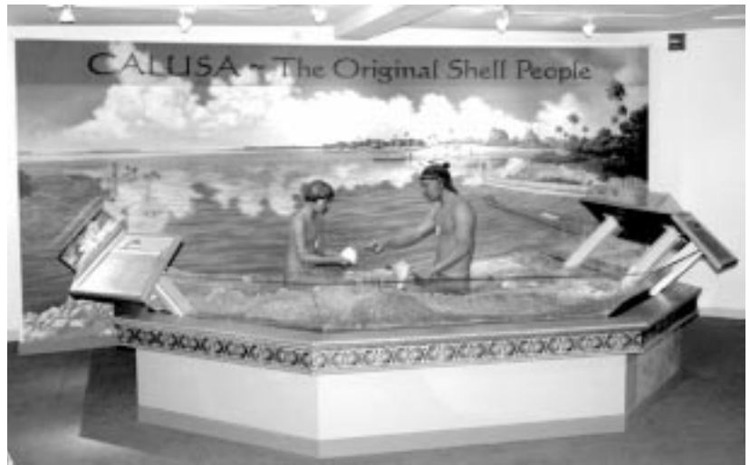
The Museum's newest exhibit, "Calusa - The Original Shell People," officially opened April 14.