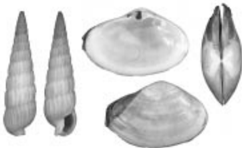
Terebra glossema , left, and Mactrotoma fragilis are two new additions to the Museum's online "Southwest Florida Shells" guide. Be sure to check the guide often for new updates. ( www.shellmuseum.org/sanibel_shells.html )